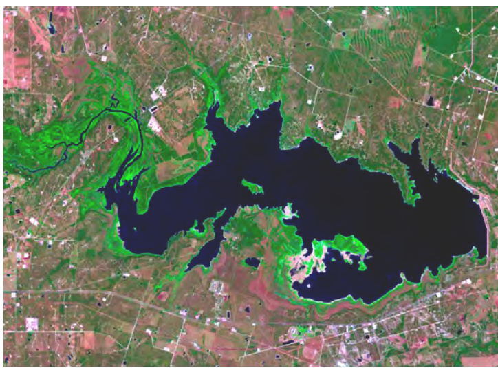
Choke Canyon, August 23, 2010, 85% full